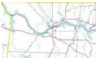
Map of Shoals' Highways

The Shoals area enjoys excellent highway infrastructure without heavy traffic congestion. The Shoals is located on US Highway 72, a major east-west corridor leading from the Southeast US to Memphis, TN, and beyond. Four-lane US Highway 72 connects directly with I-65 to the east