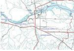
Map of Rail Lines

Rail service is readily available to business and industry in the Shoals. Norfolk Southern Railroad serves Colbert County, and Tennessee Southern Railroad , a short line that connects directly to CSX Railroad , serves Lauderdale County.