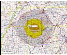
Map of Airport Locations